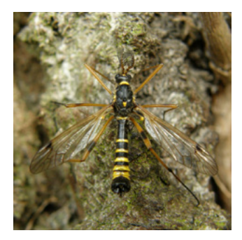
The hoverfly ( Pocota personata ) (top right) breeds in water-filled rot holes (left); the cranefly ( Ctenophora flaveolata ) breeds in heart rot (lower right).

need trees standing in open, sunny situations. The various forms of heartwood rot, which lead to trunk hollowing, produce a particularly important set of microhabitats. Veteran trees, especially those in more humid, partially shaded areas, are also very important for flies, such as hoverflies and craneflies (e.g. Royal splinter cranefly). Trees in the open are also valuable for flies when they support wet wood rot underground or in rot holes (e.g. for the Golden hoverfly).