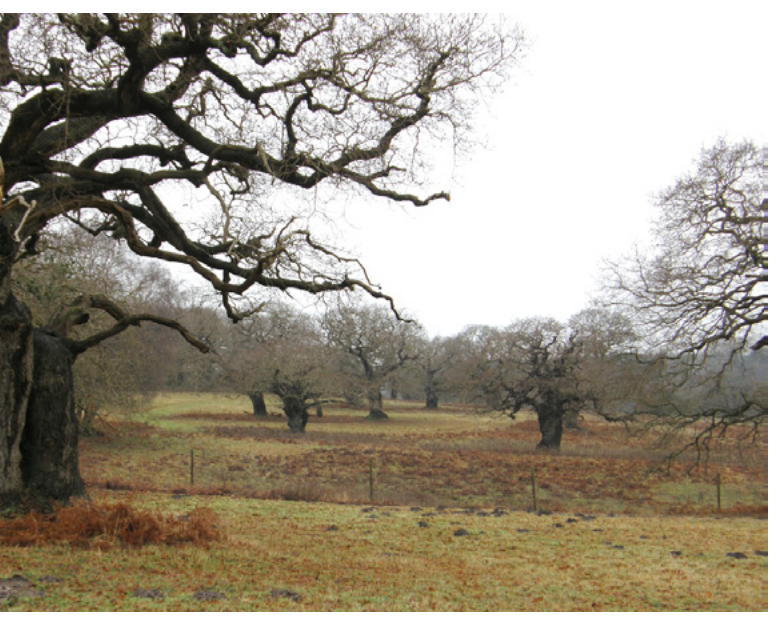
Heathland and acid grassland within wood pasture (Staverton Park, Suffolk).