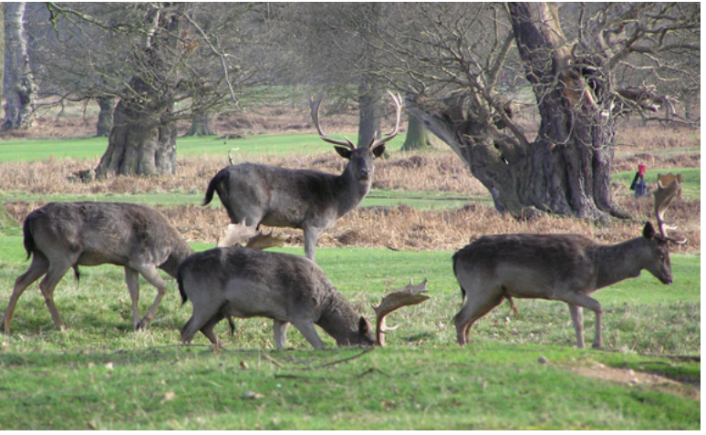
Some wood pastures sites have experienced many centuries of continuous grazing.