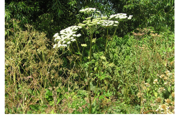
Tall herb vegetation with Hogweed