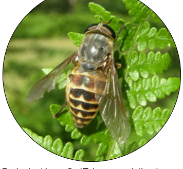
Dark giant horsefly (Tabanus sudeticus)