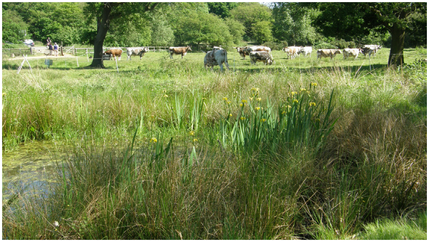
A wood pasture pond in Epping Forest, which supports a fine range of dragonflies.