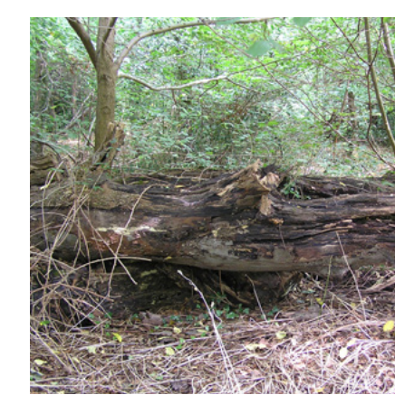
A freshly fallen Beech will provide varied microhabitats for several decades (top). A veteran tree supports specialised fungi and associated invertebrates (lower left). A fallen trunk in partially shaded conditions supports different invertebrates from one in the open (lower right).