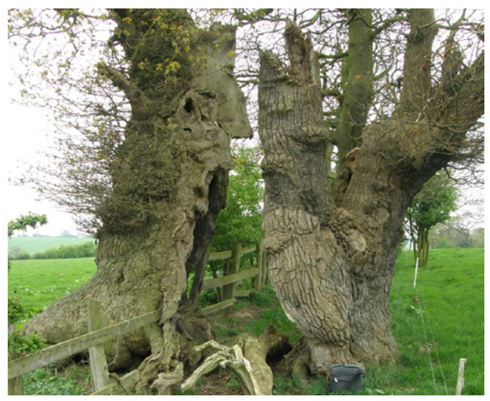
Veteran trees can occur within hedges surrounding wood pasture.